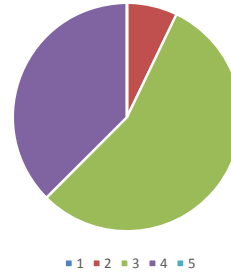
What do you think about discipline of the Institute ?