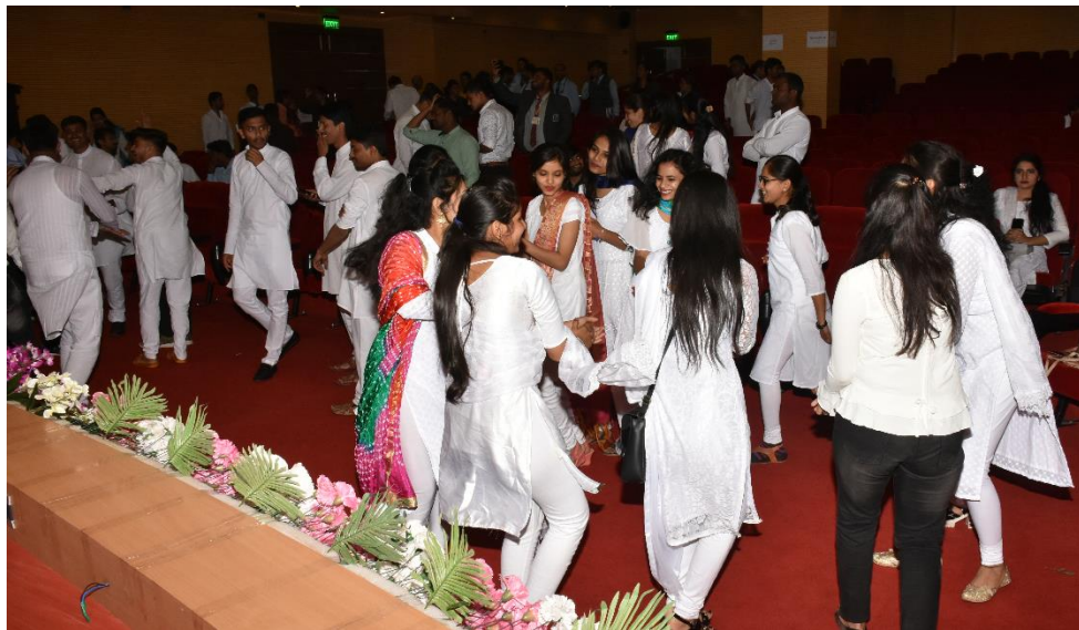
DJ Dance Program